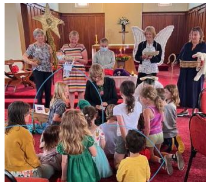
Christmas All-sorts Service 2024

Our vision is of a Church come alive again. A place, which is open 7 days a week; a Church where people come and go; a Church where everyone finds belonging no matter 'who', 'what' or 'how' they are; a Church working in partnership with community to connect people with each other and with God.