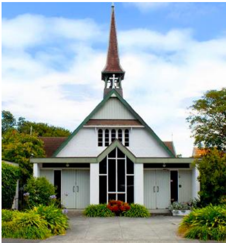
St Alban's Church

The Church and Hall buildings were closed in 2016 when they were assessed as being earthquake prone (less than 34% New Building Standard (NBS)).