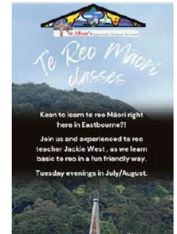
For our community!

When strengthened, the Church building will provide for Worship and gatherings such as concerts and recitals and the Hall will be a space for Parish and wider Community - think film nights, dances, a repair café, playgroup, lunch group, youth group and a base to support the many activities that Eastbourne provides, as well as for our current activities such as Pop-in-and-Play and Take-a-Break. Space is always at a premium in Eastbourne, and we believe a low-cost quality space will really help the community to connect and thrive.