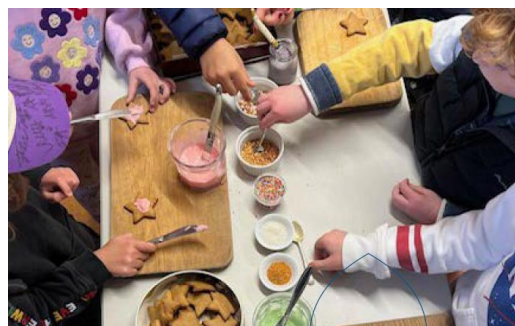
Making Cookies at Matariki